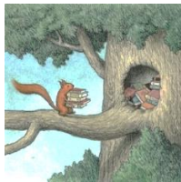
Getting Ready For Winter

Sunday CLOSED Monday CLOSED Tuesday 10-6 Wednesday 10-5 Thursday 10-5 Friday 10-5 Saturday 9-3